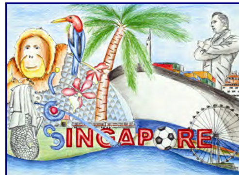
Middle School Art Contest Winner